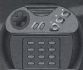
Fig 5a. Overlay