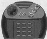
THE JAGUAR CONTROL PAD