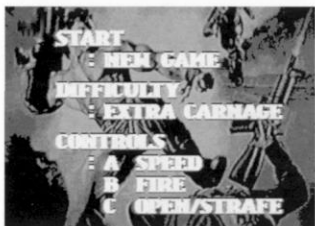
Fig.2 Menu Screen